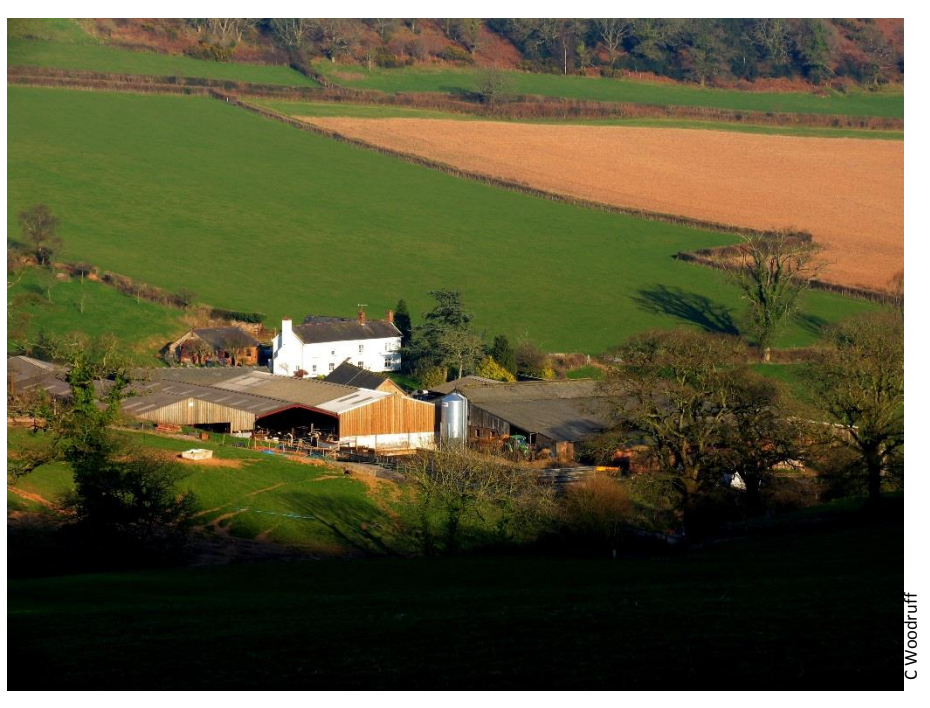
BURSCOMBE FARM, SIDBURY